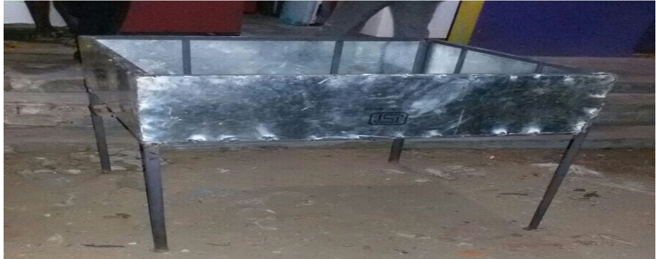
Fig mild steel with two flate plate collector

The mild still angle are L-shaped structural steel represented by dimension of sides & thickness. For e.g.50cmx50cmx6cm means, both the sides of angles are 50mm & thickness is of 6mm. The is welded by filler rod into dimensions of (0.9mx0.9mx0.3m) it re angular shape it connected by stand like material the stainless still are used cover material which can with stand heavy load such as pebbles, red stone with any error welding process is used join the material into respective shape .carbon steel is steel in which the main interstitial alloying constituent is carbon in the range of 0.12-2.0% The American iron and steel institute (AISI).